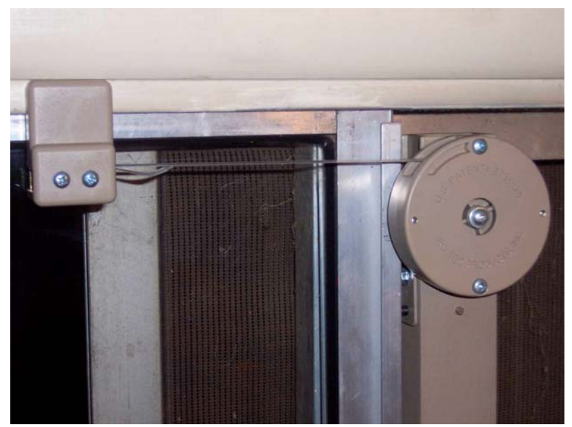
Strap closer correctly installed on left handed door with strap anchor cover installed.