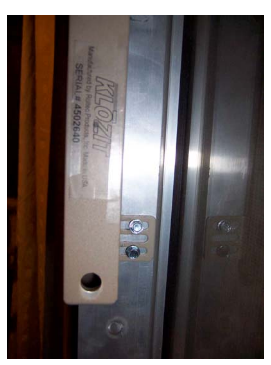
Closer vertical with door and bottom two hex head mounting screws installed on mounting bracket