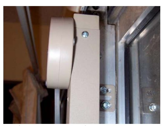
4th hex head screw installed on top mounting bracket