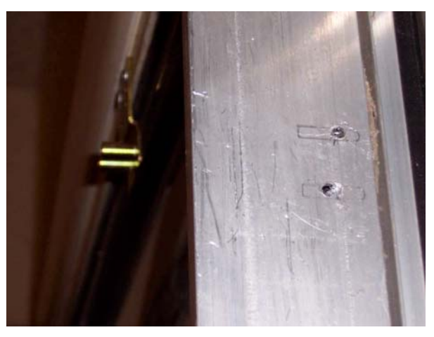
Horizontal slot marked (already drilled)